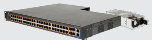
EX2052R-P / CRPS