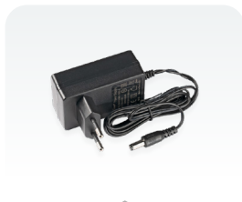
24 V 1.2 A power adapter