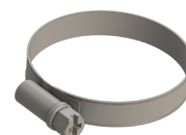
50-70mm hose clamp