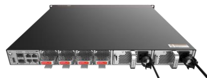
NetEngine 8000 F1A (AC)