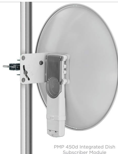
PMP 450d Integrated Dish Subscriber Module